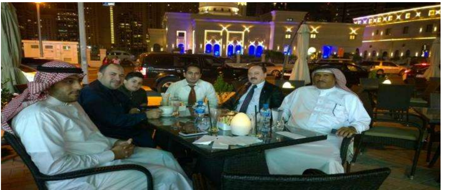
Meeting with Bahrain Governments Personalities in UAE