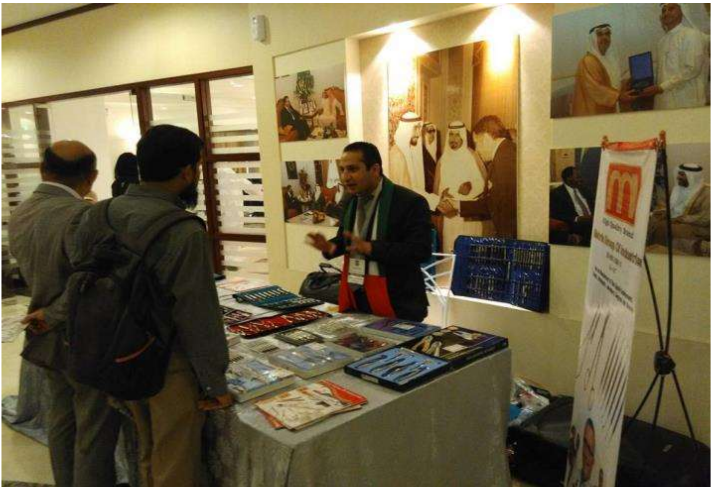
Stall In Abu Dhabi Chamber