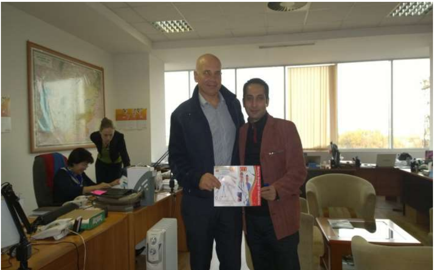
USA Embassy In Almaty