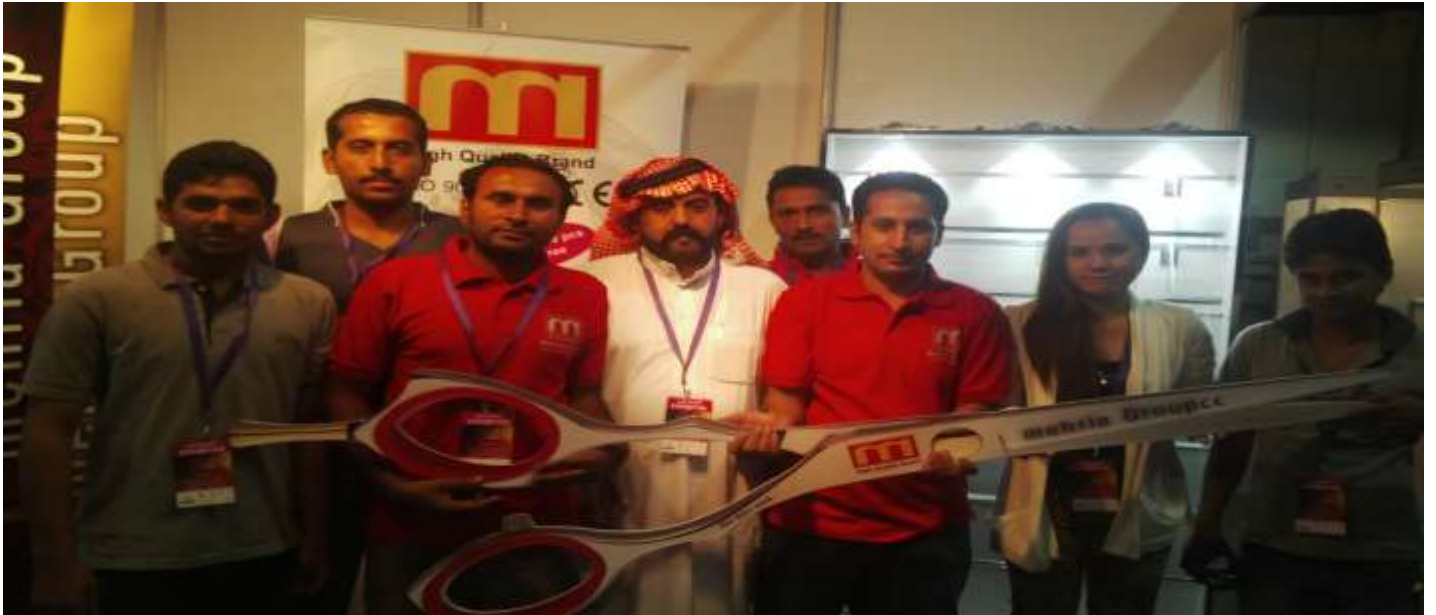
First time making scissors for very large size in all over the world under brand Mehria group