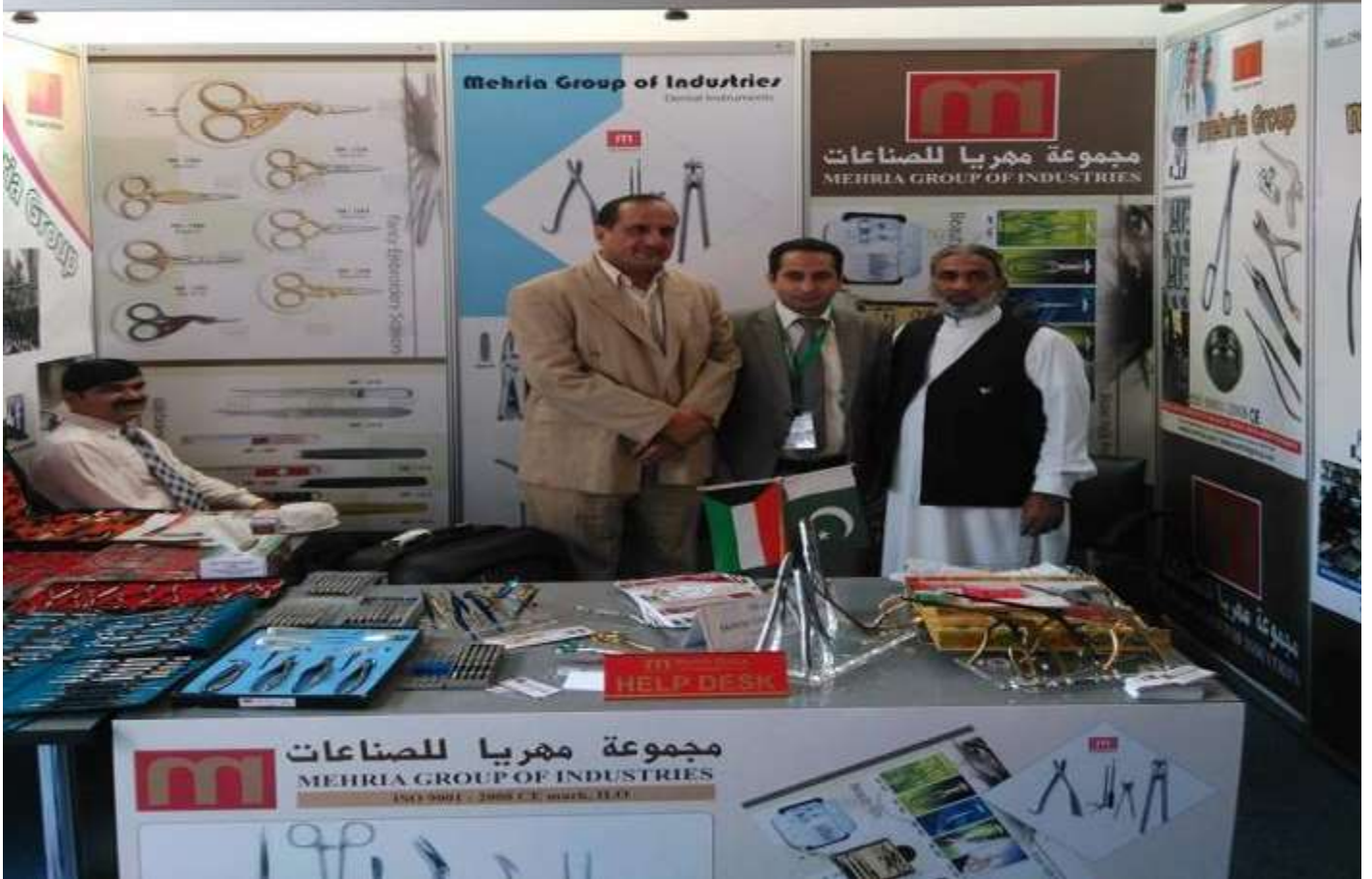
In Kuwait With Commercial consoler & Chairman trade Delegation